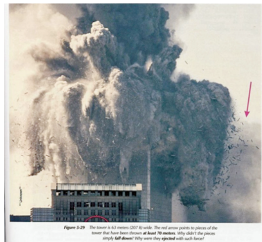
Figure 3-29 The tower is 63 meters (207 ft) wide. The red arrow points to pieces of the tower that have been thrown at least 70 meters. Why didn't the pieces simply fall down? Why were they ejected with such force?

Explosive Destruction Pattern at WTC Towers The tower is 63 meters (207) ft wide. The red arrow points to pieces of the tower that have been thrown at least 70 meters. Why didn't the pieces simply fall down ? Why were they ejected with such force? http://911research.wtc7.net/talks/towers/index.html